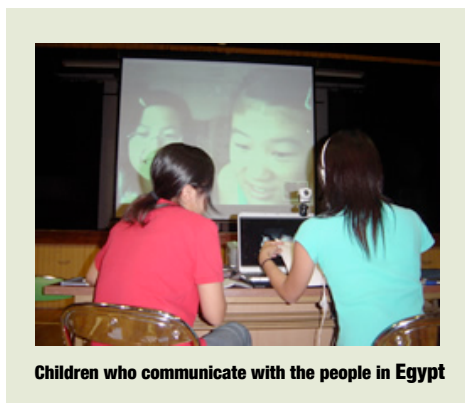
Children who communicate with the people in Egypt

with the people, who we asked beforehand, at 10:00 am of the five different countries' time.